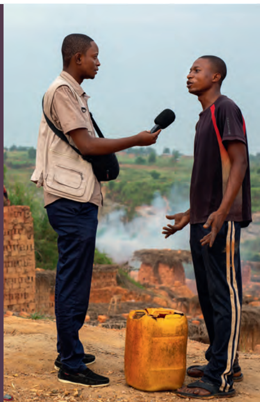
© Gwenn Dubourthoumieu / Fondation Hironnelle