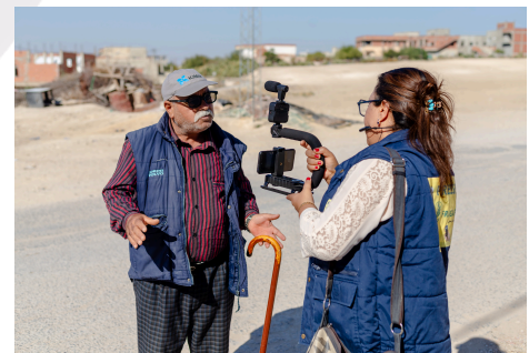
A Friga FM journalist conducts interviews in the streets of Kef, Tunisia in 2023.

In 2023, the journalistic content was disseminated by the network's media, on their airwaves and online platforms, as well as on a dedicated Facebook page, which gave them greater visibility.