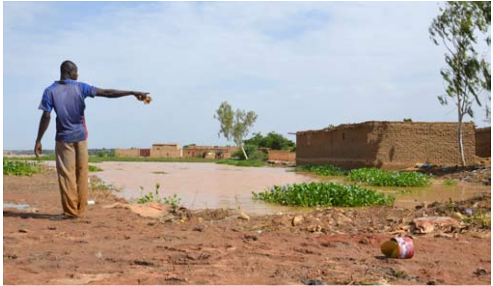
By the Niger River in Niamey, after several areas of Niger's capital were flooded in September 2016.

The full issue can be found online in German and English on the Heinrich Böll Foundation's website: http://boell.de .