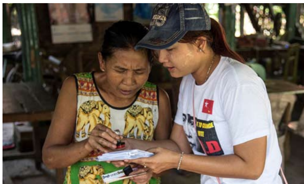
Electoral campaign in Karen State, Myanmar, for the historic elections of November 2015 that brought Aung San Suu Kyi's National League for Democracy to victory.

These activities are part of a larger project with the Myanmar Hluttaw , which aims to improve the population's understanding of the political process through better reporting and access to information, enabling greater transparency and accountability for Myanmar's fledgling democracy.