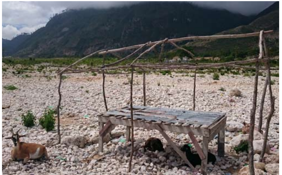
Rural market abandoned after 10 months of rain in Haiti, April 2015.

Jean-Marie Etter, CEO Fondation Hironnelle