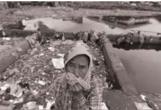
Indonesian mother at a refuse-filled dam, Jakarta, 2013.

NEWS FROM FONDATION HIRONDELLE | NUMBER 50 | NOVEMBER 2016