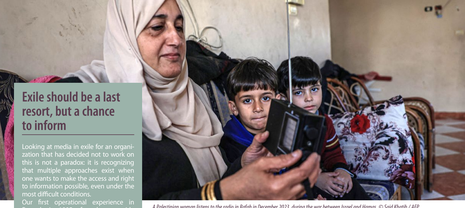
A Palestinian woman listens to the radio in Rafah in December 2023, during the war between Israel and Hamas.

Understanding through information and dialogue