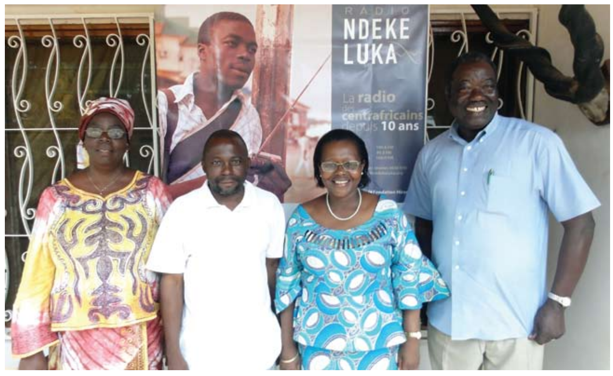
© Members of Fondation Ndeke Luka in Bangui (Photo: Jean-Pierre Husi/Fondation Hirondelle)

ensure the news is covered in all the provinces, even in the remotest areas, thus helping to make Radio Ndeke Luka a truly national radio. Shortwave broadcasting across the entire country continued without a problem until mid-December However, the installation of a new FM transmitter had to be postponed again owing to lack of funding. The rebroadcasting partnership with community radio stations had to be put back for the same reason. Visits to the website -- which offers all the standard services of the profession such as podcasts, RSS, live streaming, free document downloads, text and audio archives -- continued to rise.