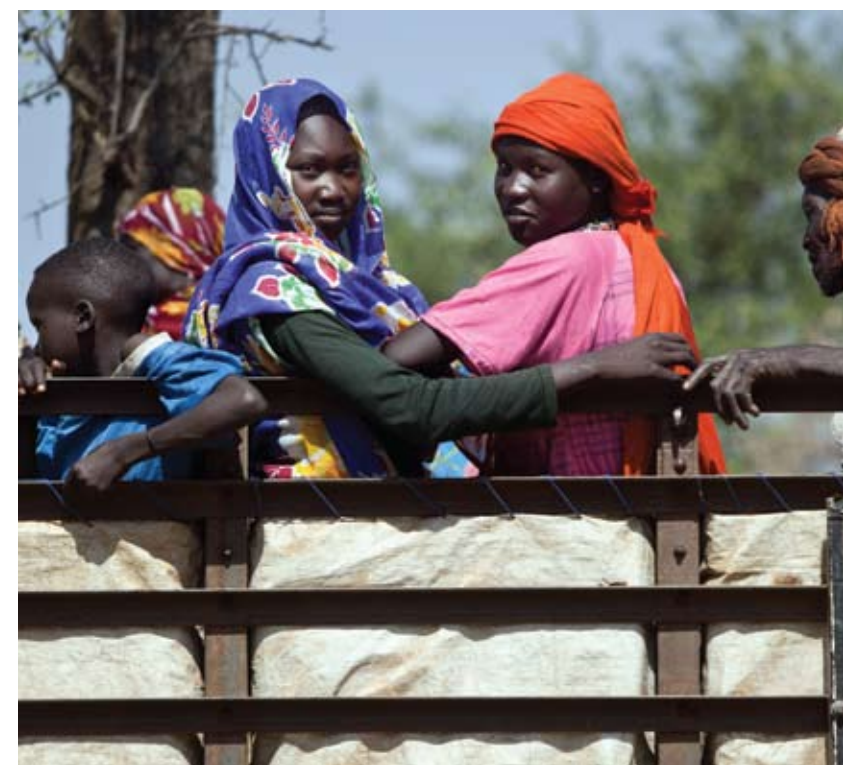
© Jamam refugee camp, Upper Nile State (Photo: Gwenn Dubourthoumieu)