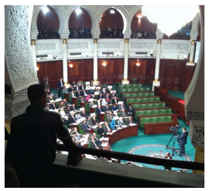
© National Constituent Assembly (Photo: Fondation Hirondelle)