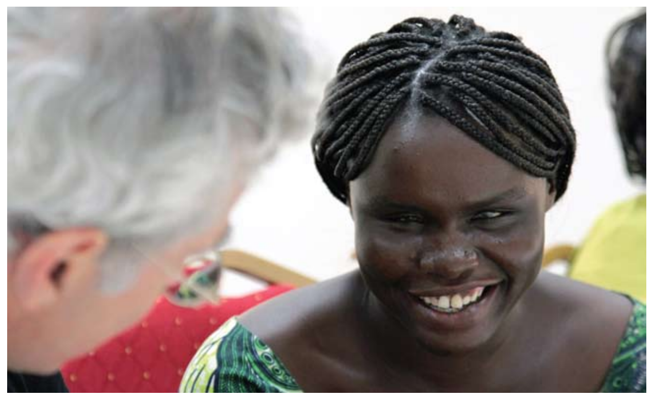
Workshop in Juba, South Sudan

The long negotiating process revolved around presenting to the SDC a Plan of Action for 2013-2016, giving a full outline of Fondation Hirondelle's goals. Asked to make a proposal in terms of a medium-term Plan, Fondation Hirondelle conducted extensive internal reflection on what it wants to do, how to do it and how to translate this into concrete, quantifiable activities over a four-year period, despite the difficulty of forecasting events and the rapid development of the media sector. Its Plan of Action contains four main strategic areas of action: "Producing, Broadcasting and Evaluating"; "Supporting and Training"; "Working for Sustainability"; and "Encouraging Research and Development and Building Networks".