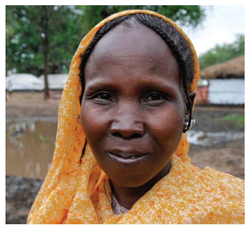
© Batil camp, South Sudan (Photo: Marc Elisson/Fondation Hirondelle)