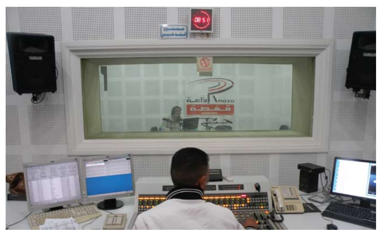
One of Radio Tunisienne's regional studios

Following the positive experience at Radio Gafsa, the management of Radio Tunisienne has asked Fondation Hirondelle to extend the work of reorganization to its Kef and Tataouine regional radio stations.