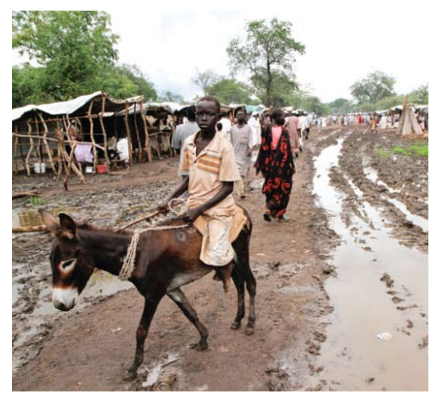
© Batil camp, South Sudan (Photo: Marc Elisson/Fondation Hirondelle)

In Palestine, we are maintaining our partnership with the Hope Flowers School of Bethlehem.