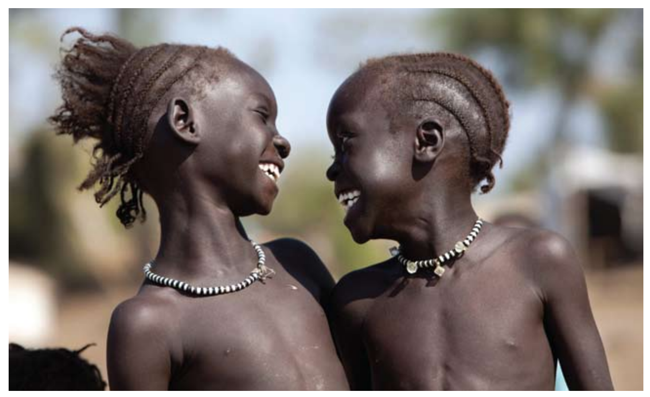
© Children in the Jamam refugee camp (Photo: Gwenn Dubourthoumieu)

for every international meeting on Sudan-South Sudan relations, notably those of the African Union.