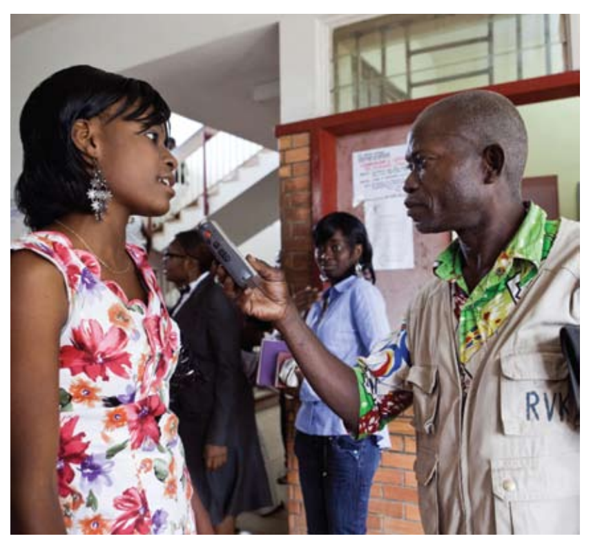
© Journalist from a Radio Okapi partner radio reporting (Photo: Gwenn Dubourthoumieu/Fondation Hirondelle)