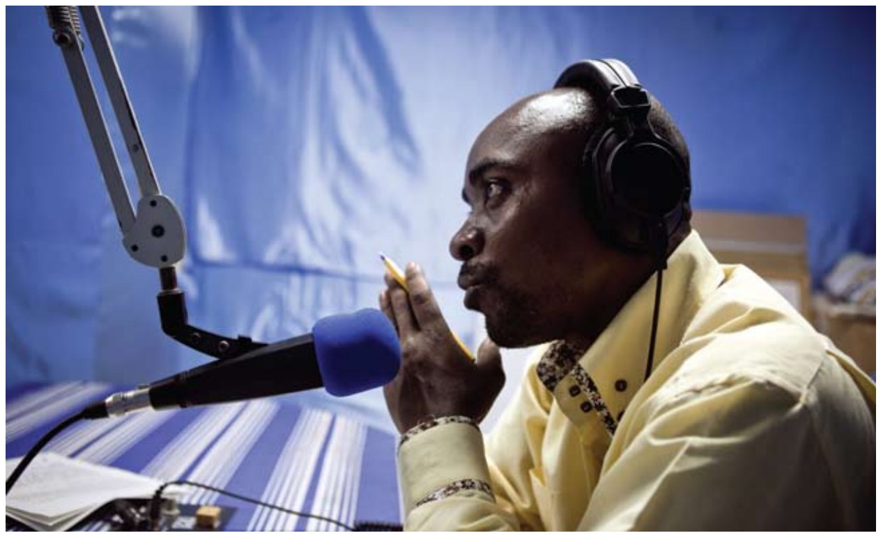
© Radio Okapi studio in Goma (Photo: Gwenn Dubourthoumieu/Fondation Hirondelle)

reached its full potential. The first steps have been taken toward generating revenue by selling airtime on Radio Okapi for the broadcast of institutional communication campaigns. However, the real potential of this market remains uncertain, while the budget to be funded remains considerable, owing to the size of the radio station and the multitude of activities being carried out.