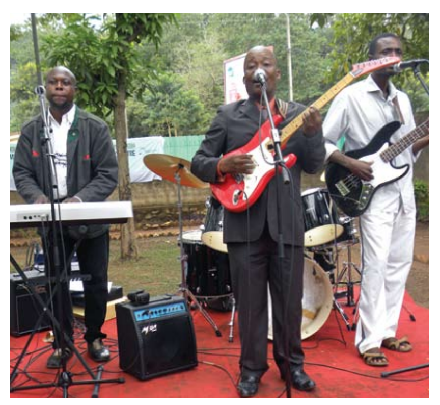
© Radio Ndeke Luka donation of musical instruments (Photo: Fondation Hirondelle)