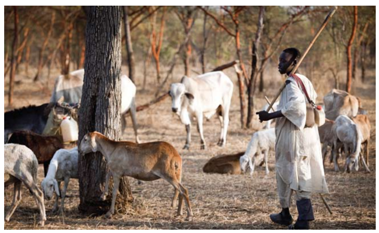
Young herdsman, Upper Nile State